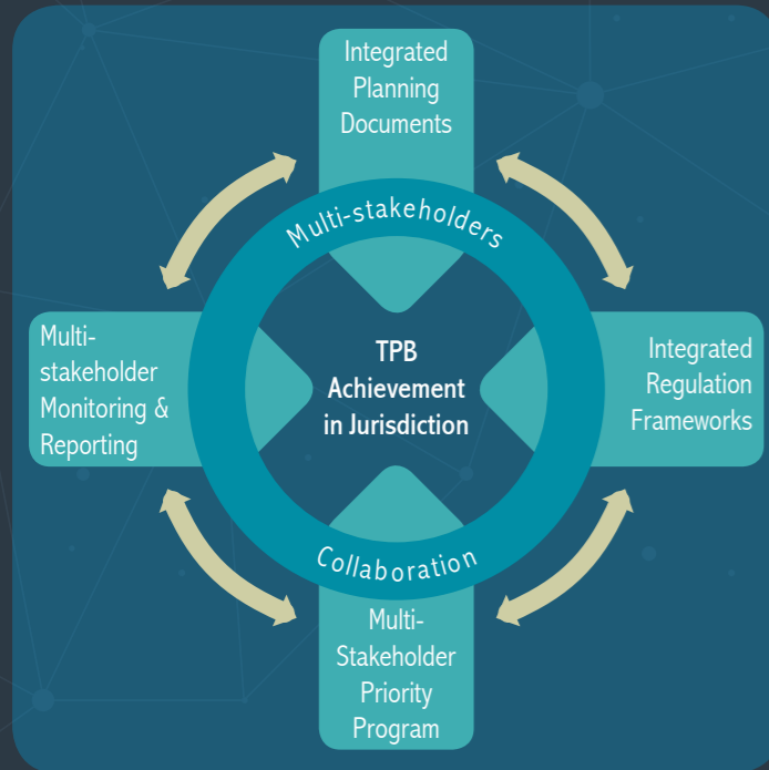
JA Enabling Pillars